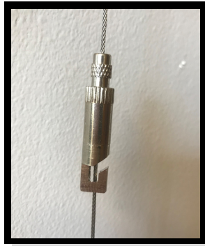
Slim Hook Gripper