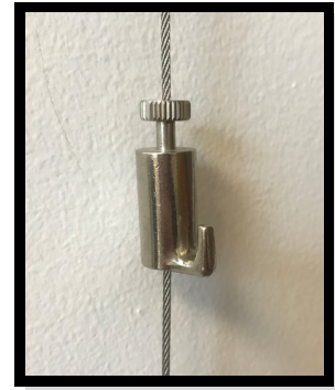
Self-Gripping Cable Hook